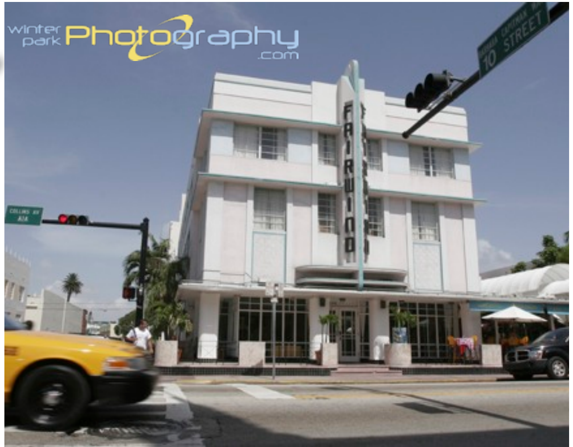
Right: Fairwind Hotel on Miami's Collins Avenue. Photographed in June 2006.