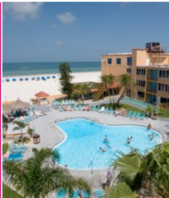
Pictured Right: Dolphin Beach Hotel, St. Pete's Beach, Florida. Far Right: Hyatt Regency, Fort Lauderdale, Florida.