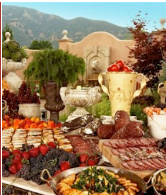
Right: Italian style food station, which was outdoors with wonderful views of the mountains behind. Far Right: Tapas station in the hotels main building.

The Broadmoor has hosted many famous people throughout the years including the likes of JFK and Walt Disney, even Margaret Thatcher stayed there once. Its nice to be in a hotel with history like that and enjoy the same views as those great people did. If ever you get the opportunity to visit the Broadmoor, don't turn it down. Its right up there in the top hotels list.