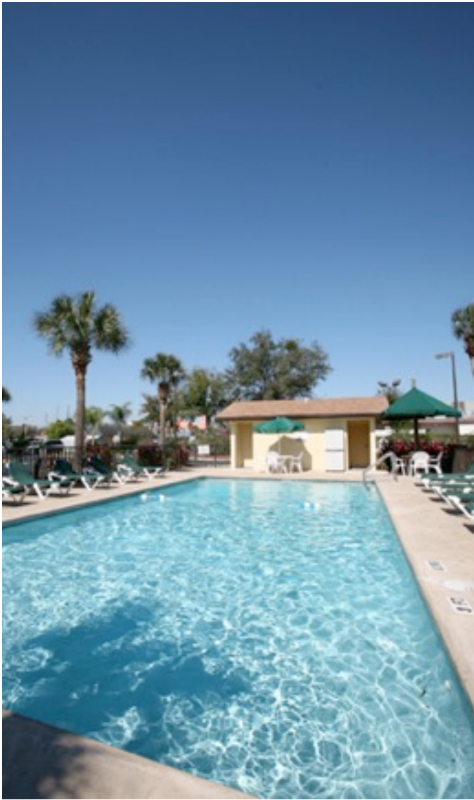
Left: The swimming pool of the Amerihost in Kissimmee. The new addition to Sky Resort management list of properties. Below: The arrival of the inaugural First Choice flight from Bristol into Orlando Sanford International Airport on February 4th.