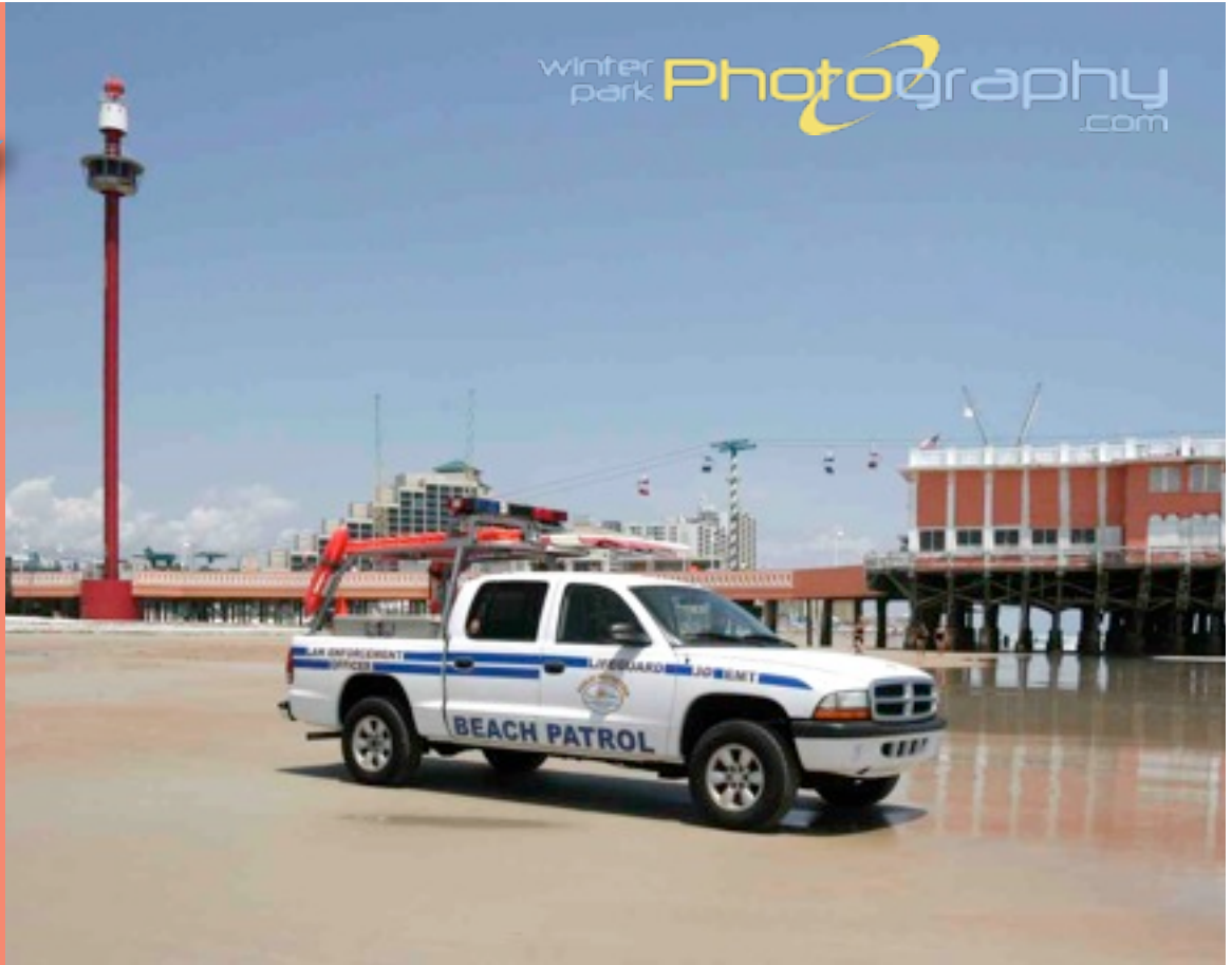
Right: Beach Patrol with Daytona Beach Pier in the background. Brings to mind recollections of Baywatch. Below Right: The Lobby of the Plaza Ocean Club.